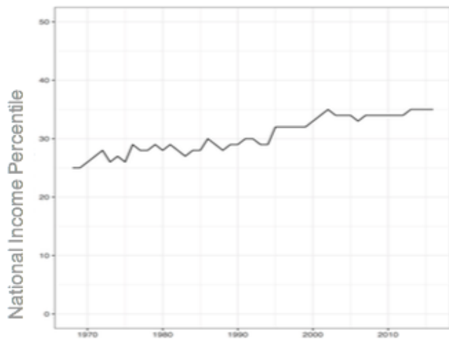
Median Black Family Income Rank Over Time