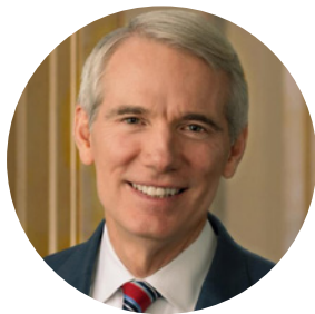
SEN. ROB PORTMAN U.S. Senate 2011-2023 (R-OH) Minneapolis-St. Paul