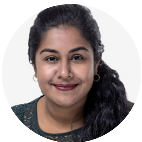
ELENA GOORAY Los Angeles Times Los Angeles Unified