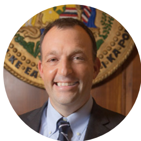
GOV. JOSHUA GREEN Governor of Hawaii Hawaii