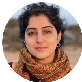
NAFEESA SYEED Los Angeles Times Los Angeles Unified