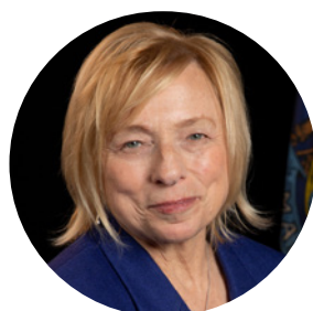
GOV. JANET MILLS Governor of Maine Maine