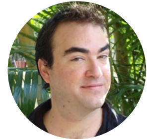
DAN SWEENEY South Florida Sun Sentinel Florida